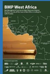
BMP West Africa